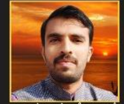
ವಿಹಾರಿಬಲ್ ಕುಮಾರಿ ಶಿಕ್ಷಣದೇಹೆಗೆ ಒಂದು ಹೆಜ್ಜೆ