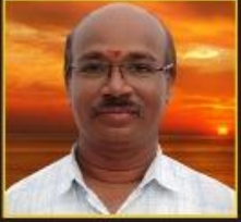
ನಾಗು ಶಿಕ್ಷಣದೇಹೆಗೆ ಒಂದು ಹೆಜ್ಜೆ